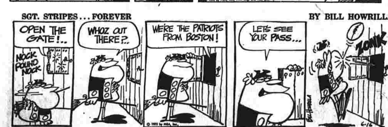
BY BILL HOWRILLA